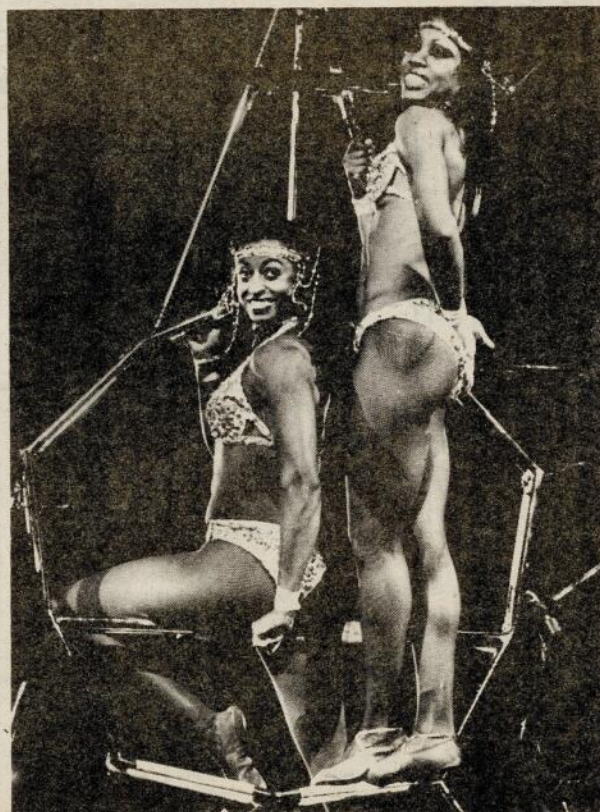
Satin's shimmering and scintillating aerial acrobatics astound audiences by displaying their strength and control as part of the all-new 117th Edition of Ringling Bros. and Barnum & Bailey Circus.

The stars promise to amaze and delight children of all ages in the Greatest Show on Earth.